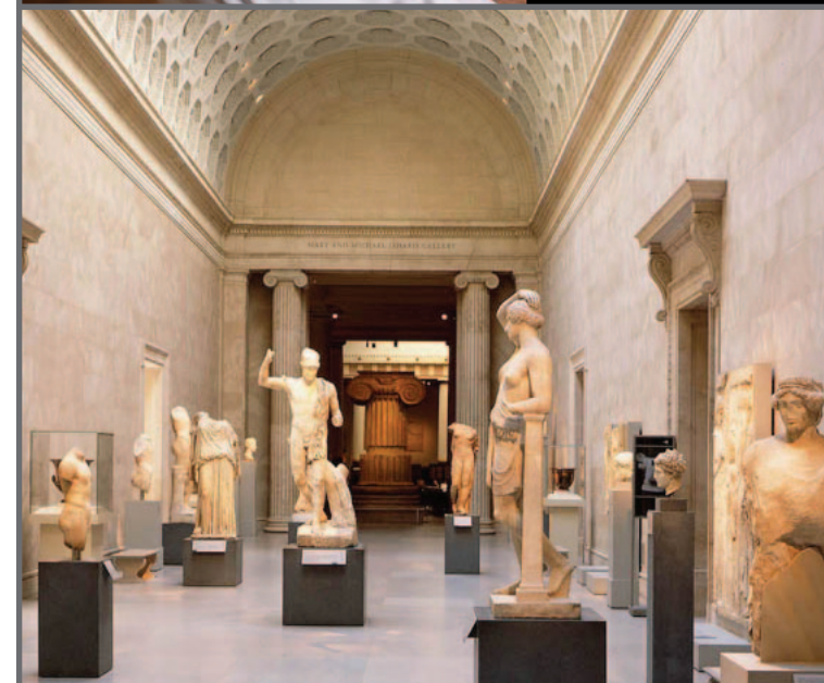
GREAT MUSEUMS - 32 x 30 & 9 x 60