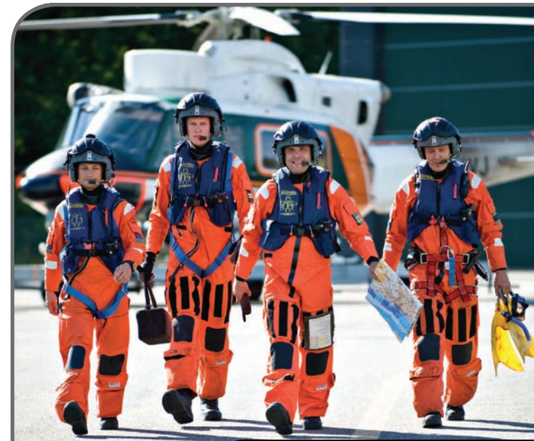
RESCUE HELICOPTER - 48 x 30